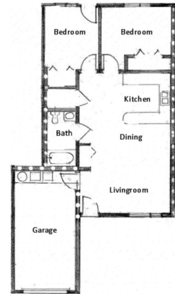
TWO BEDROOM/1 BATH 742 SQFT