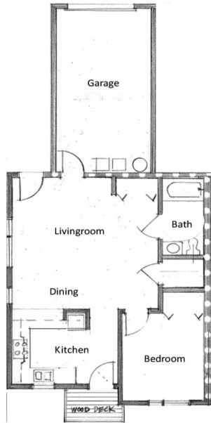
ONE BEDROOM/1 BATH 738 SGFT